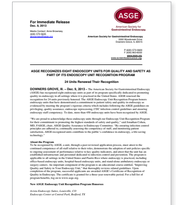
ASGE CERTIFICATE OF RECOGNITION OF QUALITY IN ENDOSCOPY