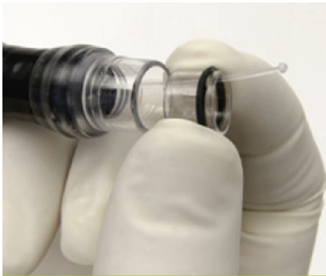
Figure 1. Stiegman-Goff Bandito Ligator.

to the rectal wall. 8 This technique is similar to the banding of esophageal varices, except that it is often performed in retroflexion. The only device specifically marketed for endoscopic band ligation of hemorrhoids is the Stiegmann-Goff Bandito Endoscopic Hemorrhoidal Ligator (ConMed Corp, Utica, NY), which fits on a 13- to 15-mm endoscope (Fig. 1). Standard endoscopic variceal band ligation devices have been used as well. 9-12