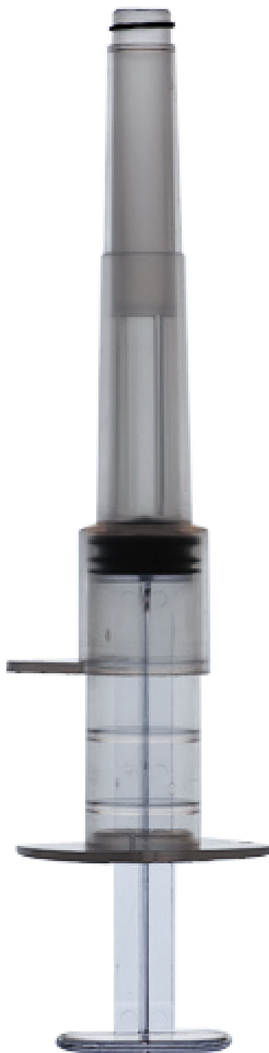
Figure 3. CRH Ligator.

The IRC 2100 (Redfield Corp, Rochelle Park, NJ) is a non-endoscopic system consisting of a compact power unit with a tungsten-halogen lamp. 15 A pistol-shaped hand-held applicator connects to the power unit, and a quartz glass light guide extends out from the shaft. The light guide has an