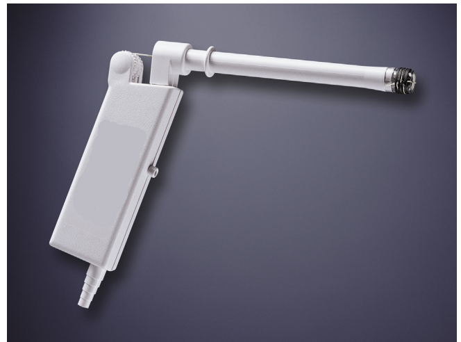
Figure 2. Shortshot™ Saeed Endoscopic Hemorrhoid Multi-band ligator. Permission for use granted by Cook Medical Incorporated, Bloomington, Indiana.

RBL without an endoscope. The ShortShot Saeed Hemorrhoidal Multi-Band Ligator (Cook Medical, Winston-Salem, NC) is a single-use, disposable device designed for use with an anoscope. It is in the shape of a pistol, with a suction tubing port at the base of the handle (Fig. 2). The tip of the ligation device holds 4 preloaded bands and is placed through an anoscope to visualize internal hemorrhoids. Suction is activated by covering a vent on the anterior side of the handle with the index finger after the tip of the ligation device is placed on the hemorrhoid, taking care to remain just above the dentate line. The vessel is suctioned into the ligation device, and a wheel is turned using the thumb, leading to deployment of a band.