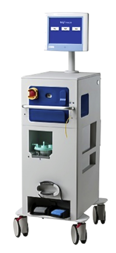
Figure 1. Liquid nitrogen spray cryotherapy console.

Nitrogen rapidly expands from liquid to gas, so a dualchannel decompression tube is placed before treatment to allow active and passive gas venting to prevent GI luminal perforation. The suction tubing connects to the console and allows for continuous suction throughout