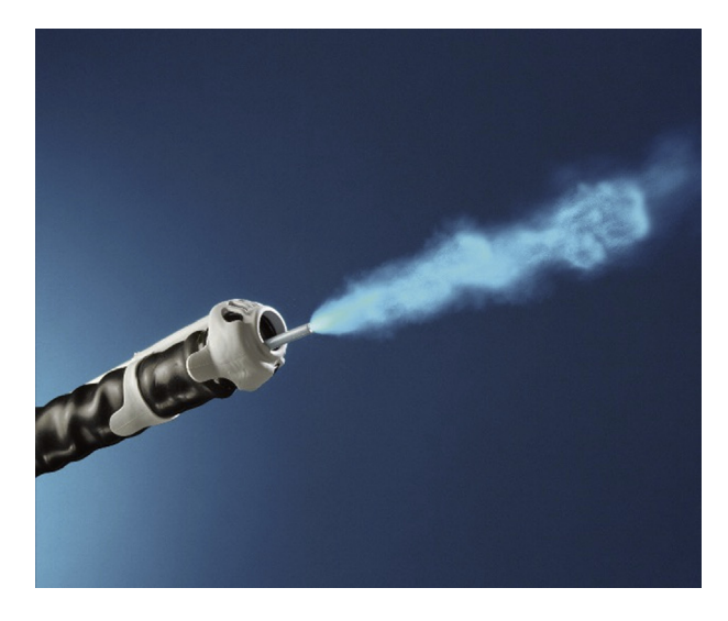
Figure 4. Carbon dioxide spray cryotherapy distal attachment cap with the spray catheter.

the size of the esophagus (approximately 20 to 35 mm) at a low pressure generated by the nitrous oxide system. Continued activation of the trigger delivers the cryogen from the cartridge to the balloon. The cryogen emerges from a 1-mm opening in the side of the catheter, delivering a focal spray within the balloon that is perpendicular to the axis of the catheter. The liquid nitrous oxide focally cools the area of the balloon exposed to the cryogen to -85 °C. As such, the tissue directly apposed to the area of the balloon receiving the stream of cryogen from the catheter will be ablated (focal areas of treatment). A brief test spray helps confirm proper catheter position. Prolonged trigger activation delivers a preset amount of cryogen that may be modified by adjusting the program on the handle. The site of ablation can be changed by rotating the catheter (to change the ablation site at the same level) or by inserting or retracting the balloon catheter to ablate a site at a different level. When the balloon is deflated, the remaining gas is vented back to the handle (Video 2, available online at www.VideoGIE.org).