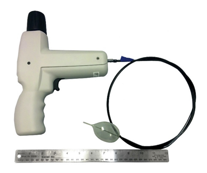
Figure 5. Nitrous oxide cryotherapy system. (Image courtesy of C2 Therapeutics.)

Cryotherapy for Barrett's esophagus using liquid nitrogen. In a prospective multicenter study, 80 patients with dysplastic BE completed endoscopic cryotherapy every 2 to 3 months until there was no endoscopic evidence of BE and no histologic evidence of dysplasia,