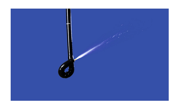
Figure 2. Liquid nitrogen spray cryotherapy catheter.

the entire procedure.<sup>20</sup> The current system also has a pressure-sensing capability that audibly alerts the endoscopist when luminal pressures are elevated above a set threshold.