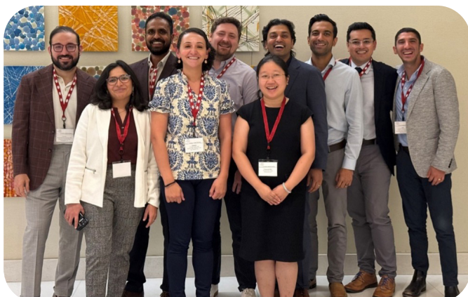
AI Summit Scholars, September 2025